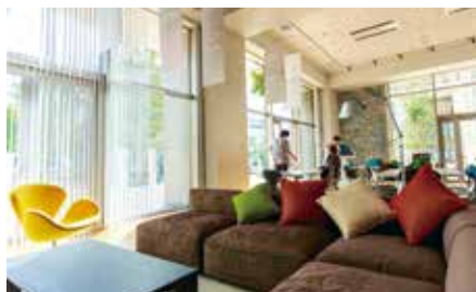
Urban Design Center Kashiwa