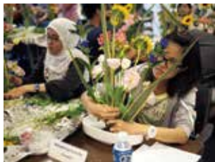
Japanese flower arrangement