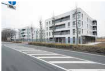
International Lodge, Kashiwa Lodge

Most participants are housed in a University Lodge located about 15 min. walking distance from the Kashiwa campus. Each room is air-conditioned; and is furnished with a desk, chair, bed, shower, and toilet.