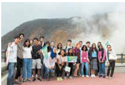
Field trip to Hakone