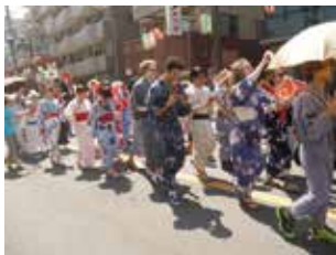
Kashiwa Matsuri in Yukata (simple kimono)