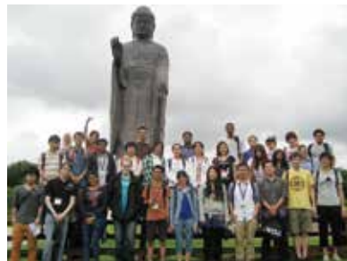
Great statue of Buddha in Tsukuba