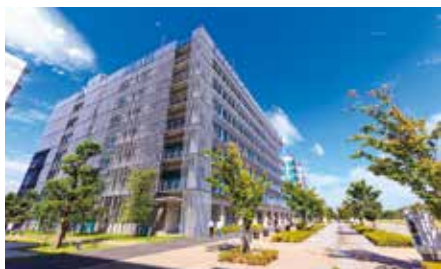
Graduate School of Frontier Sciences