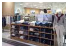
Shopping mall near Kashiwanoha Campus Station