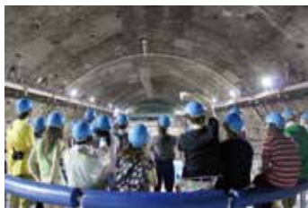
Field trip to a hydroelectric dam