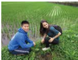
Rice field in Yamanashi